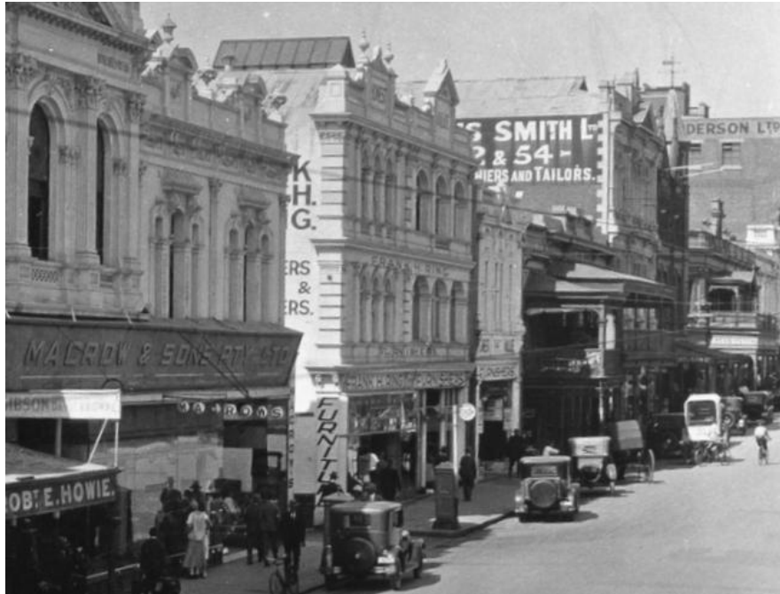
State Library of South Australia - Hindley Street looking east [B 5161], Hindley Street, looking east . Taken at 2.50 pm on February 12, 1929 to show the traffic. Businesses depicted include Robert E Howie, A MaCrow and Sons Pty. Limited, Frank H Ring Furnishers, Smith tailors. 12 February 1929. Photographer, State Library of South Australia. Part of Acre 53 and Acre 54 Collection

Admiration was expressed at the expert way in which the firemen ran out the hose to vantage-points in the two-story building and conquered the flames. The outbreak occurred in, and was practically confined to the basement of the premises. It is not yet possible to assess the actual damage by flame and water, but the brigade effected a good save. The caretaker of an adjoining shop stated that the fire broke out shortly after the premises had been closed.