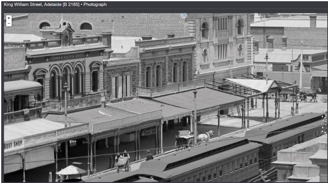
State Library of South Australia - King William Street, Adelaide [B 2185], King William Street, Adelaide, looking south from the Supreme Court building, in January, 1911. The Glenelg train is waiting for passengers. The large building with a dome is the newly completed King's Theatre. Lyons' Wallpaper Depot [extreme left] is 72 yards south of Angas Street. Approximately 1911. Photographer, Francis Gabriel. Part of Acre 452 Collection