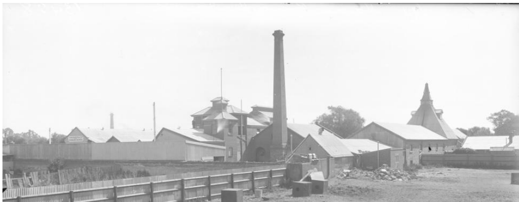
State Library of South Australia - Haussen Brewery, Hindmarsh [PRG 631/2/346-347], Views of the Haussen Brewery in Hindmarsh. 1911. Part of Hindmarsh Collection.