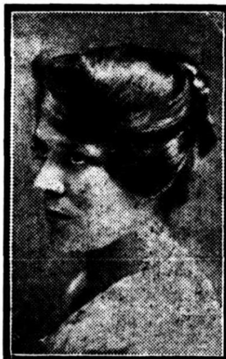
The late Miss Robinson.

Journal (Adelaide, SA : 1912 - 1923), Monday 29 March 1920, page 1