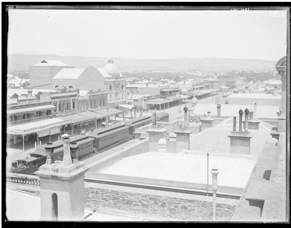
State Library of South Australia - King William Street, Adelaide [B 2185], King William Street, Adelaide, looking south from the Supreme Court building, in January, 1911. The Glenelg train is waiting for passengers. The large building with a dome is the newly completed King's Theatre. Lyons' Wallpaper Depot [extreme left] is 72 yards south of Angas Street. Approximately 1911. Photographer, Gabriel, Francis. Part of Acre 452 Collection.

Register (Adelaide, SA : 1901 - 1929), Thursday 25 March 1920, page 7